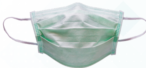
Sample: Multilayered Disposable Surgical Masks (up to 3 layers)