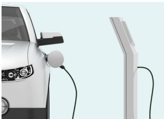
NEW DRIVE TECHNOLOGIES