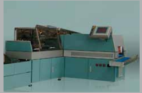
Automatic packing machines