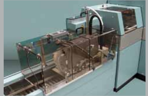
Transport and labeling units

We devise successful technical and commercial solutions in close cooperation with our OEM customers. Furthermore we ensure a delivery of serial components, modules and machines of the right quality and on schedule and offer full back-up services in the areas of: