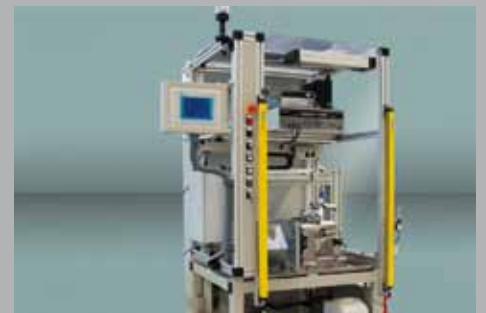
Testing systems (laboratory, series / EOL)

ruhlamat designs, manufactures and installs integrated solutions consisting of: