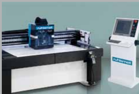
Solution for dynamic 2D-processes: FILUS 1520, e.g. ultrasonic wire embedding, cutting, pick & place, soldering, dispensing, plotting