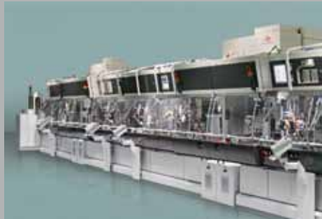
Linear transfer systems, e.g. ruhlamat Compact Carrier System (CCS) 140, allowing workpiece carrier change < 1 sec